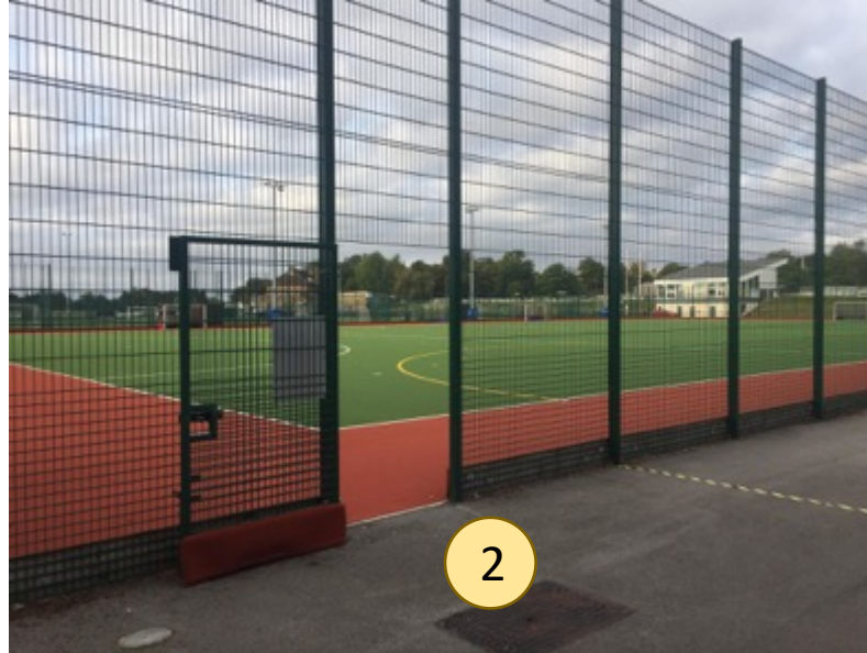
2. Away Team Entrance