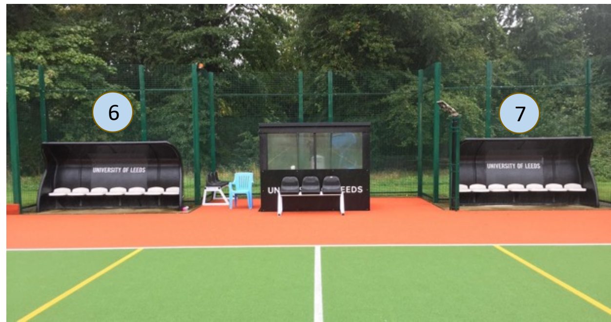
7. HOME team Dug out