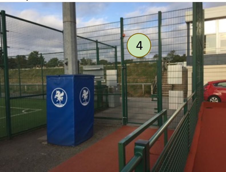
4. Spectator Entrance and Exit – No Player or Pitch Access