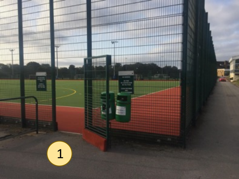
1. Home Team Entrance