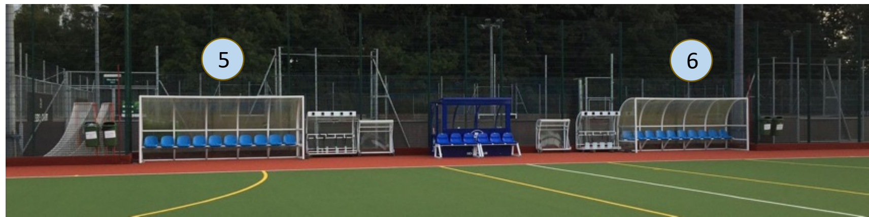
6. Away Team Dug Out