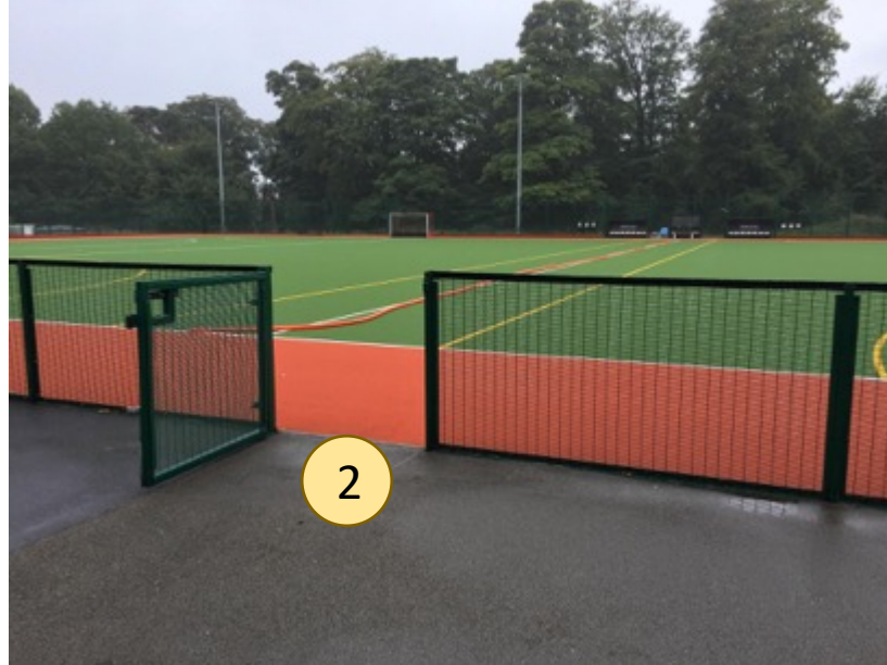
2. Home Team Pitch Entrance