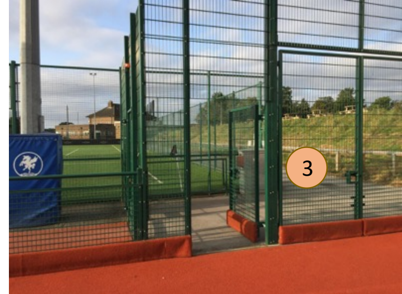
3. ALL player pitch exit – No Entrance to pitch