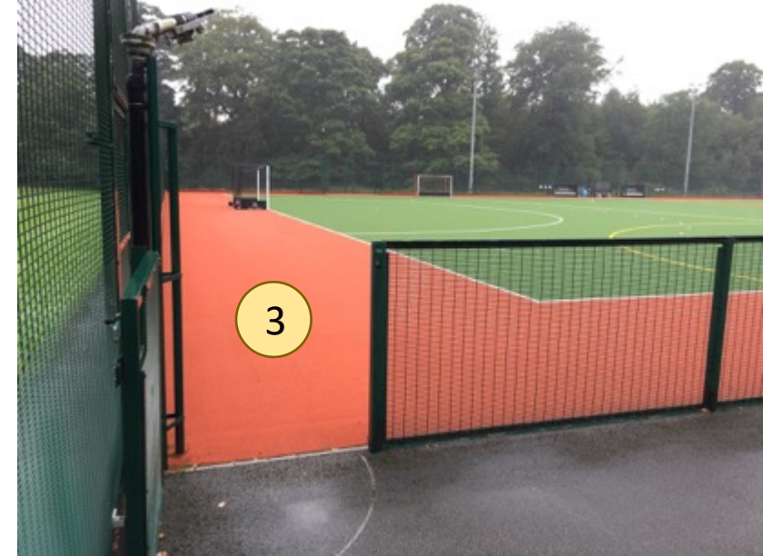
3. Away team pitch Entrance