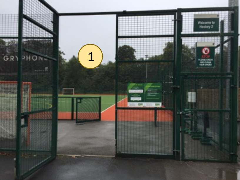
1. Entrance for ALL players and spectators